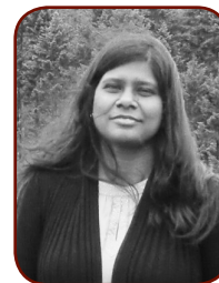
Steward of Christ Jesus,

Reflection: Acts 1; 1 John 3:16-18; John 16:13-15; 1 Corinthians 9:19-23; Romans 12:4-8; 1 Peter 4:10-11.